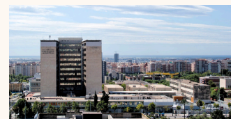
Institute of Industrial and Control Engineering, Universitat Politècnica de Catalunya Address: Av. Diagonal, 647, Les Corts, 08028 Barcelona, Spain